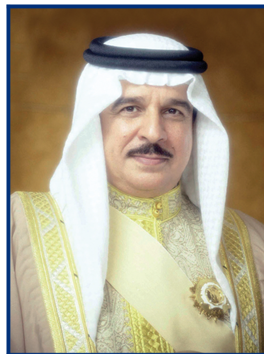
His Majesty King Hamad bin Isa Al Khalifa The King of the Kingdom of Bahrain