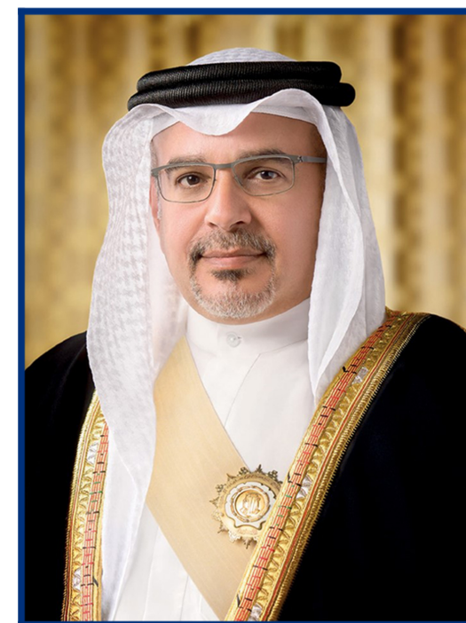
His Royal Highness Prince Salman bin Hamad Al Khalifa The Crown Prince and Prime Minister