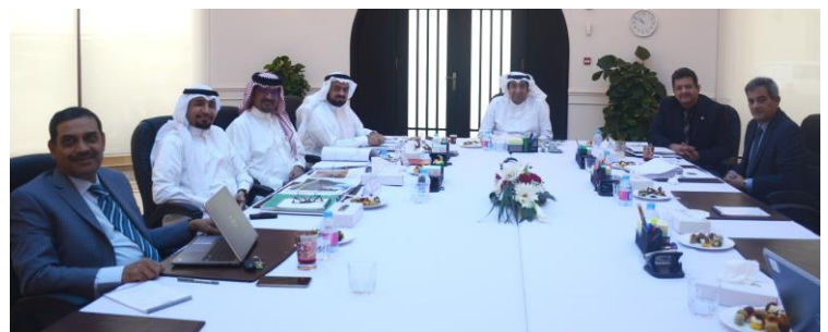
Meeting of the University Board of Directors