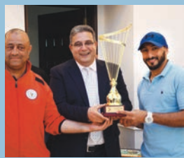
SPORTS - [38] National Football League