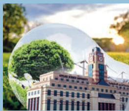
ACHIEVEMENT - [10] Sustainability