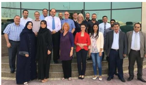
NQF Programme Mapping Workshop