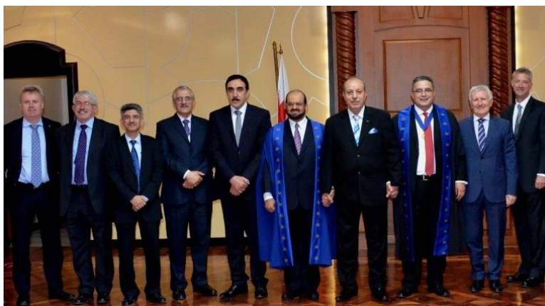
Sustainable Buildings & Infrastructures Forum