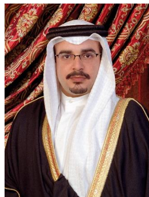
His Royal Highness Prince Salman bin Hamad Al Khalifa The Crown Prince, Deputy Supreme Commander of Bahrain Defence Force and First Deputy Prime Minister