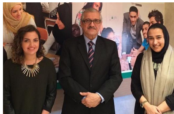
Meeting with INJAZ Bahrain