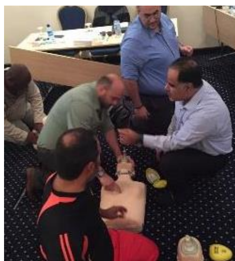
First Aid Training Day