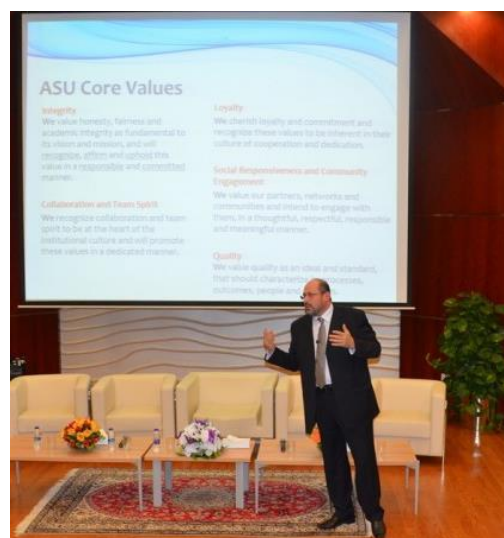
First ASU Quality Day