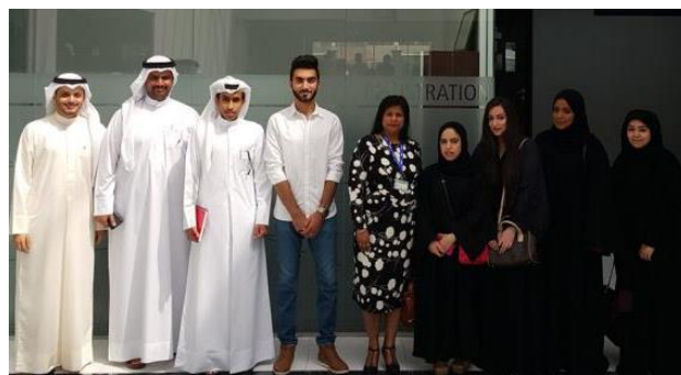
ACCA Business Challenge