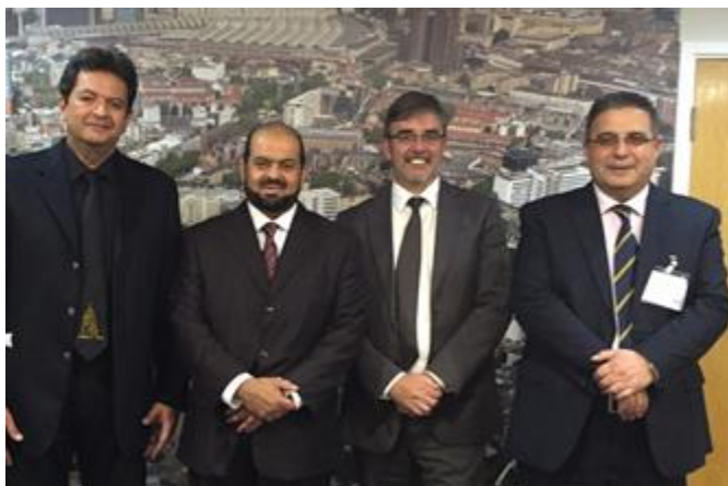
Chairman and President at LSBU