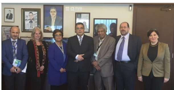
ASU Library Review