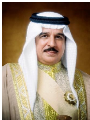
His Majesty King Hamad bin Isa Al Khalifa The King of the Kingdom of Bahrain