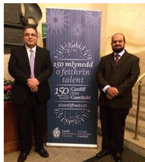
President and Chairman at CMU's 150 Years Celebration