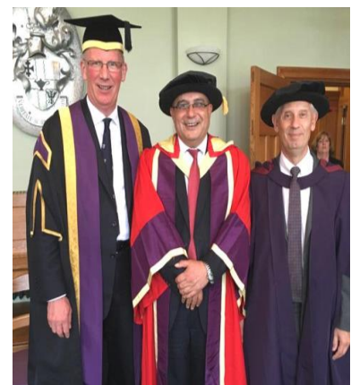
ASU President receives DTech