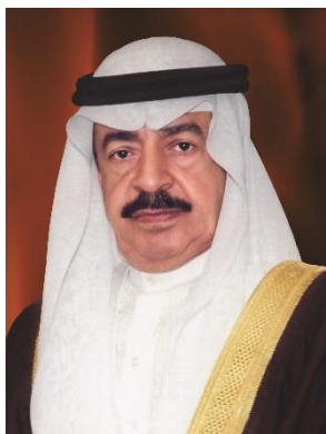
His Royal Highness Prince Khalifa bin Salman Al Khalifa The Prime Minister of the Kingdom of Bahrain