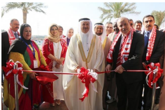
National Day Carnival